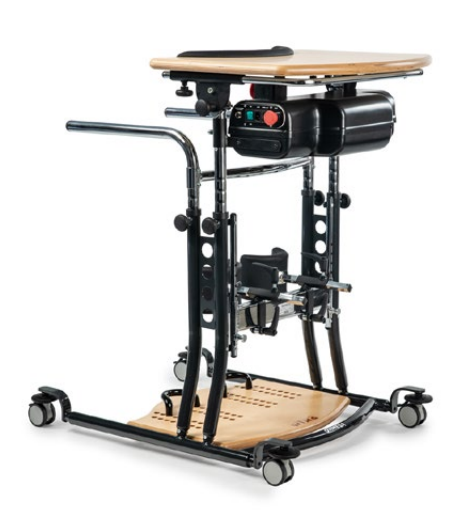
Registered FDA (USA) Marked (