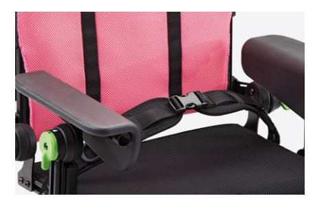
947 Pelvic belt with variable angle Available in three sizes.