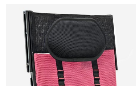
865 Padded headrest adjustable in height . Only with 823 backrest extension.

It is made of resistant and hygiene material, no edge design, it does not retain any residue of food.