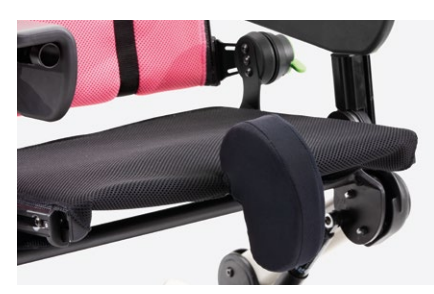
834N Narrow abduction block Available in two sizes.