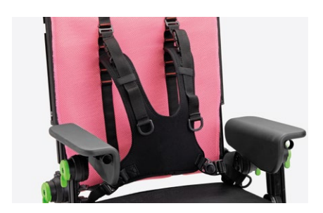
853 Vest harness Available in two sizes.