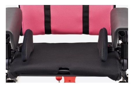
958R Padded pelvic side supports

Adjustable in width, rotation and depth.