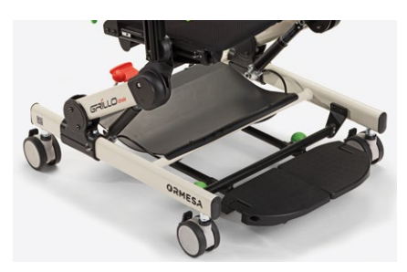
959 Set of 4 wheels with brakes as an alternative to the 4 black glides. 75 mm swivel wheels all equipped with brakes. Supplied with footrest.

For easy transport and storage. Allows the transfer even with the child seated.