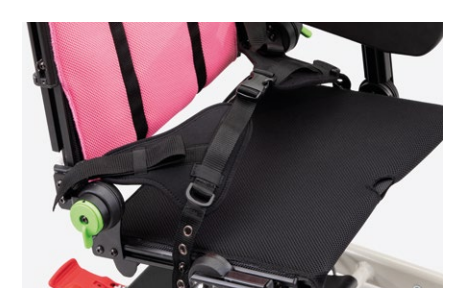
920 Four point pelvic belt Available in two sizes.