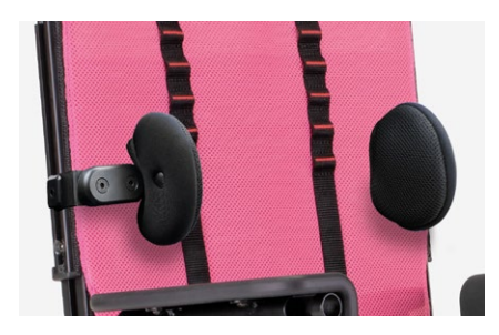
838 Trunk side supports Adjustable in height, width and rotation. Available in two sizes.