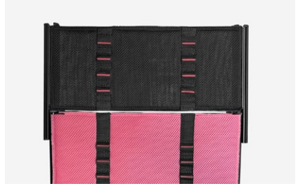
823 Backrest extension for the head support.