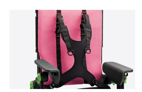
853 slim Four point shaped harness Only for Grillo Chair size Medium.