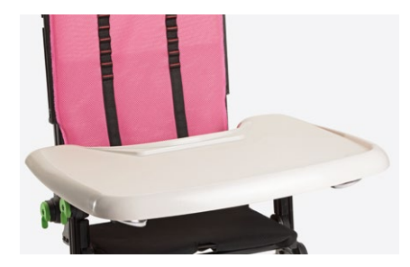
824 Tray with wrap-around recess Adjustable in depth, height and tilt with armrests.

It is made of resistant and hygiene material, no edge design, it does not retain any residue of food.