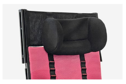
835 Shaped headrest with lateral and occipital support, adjustable in height. Only with 823 backrest extension.

Adjustable in width, rotation and depth.