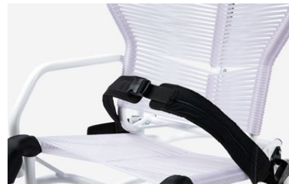
894 45° pelvic belt