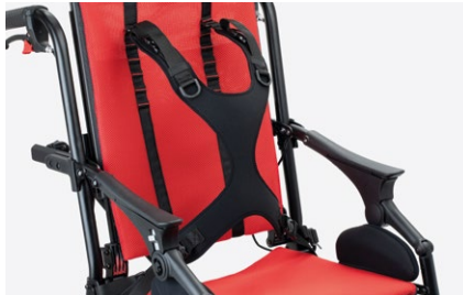
853 slim Four point shaped harness.