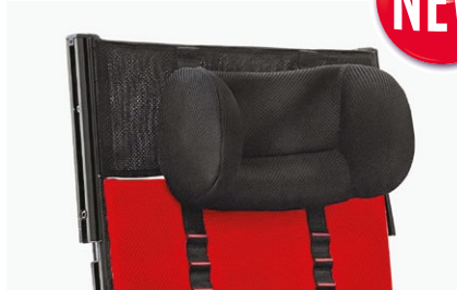
835 Shaped and enveloping headrest height adjustable. Only with backrest extension.