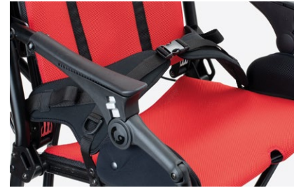
920 Four point pelvic belt Available in two sizes.