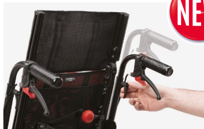
951 Height adjustable push handles. TOOLS FREE! It increases the total height of max. 7 cm/2,7 in (94-101 cm/37-39,7 in).