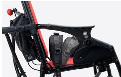
947 Pelvic belt with variable angle Available in two sizes.