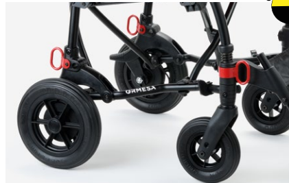
891 Set of 4 tie down hooks for the forward-facing transport of the pushchair in a motor vehicle (private/ cars, buses..). See User and Maintenance Manual provided with the aid.