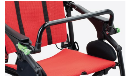
839 Front handlebar. Adjustable in tilt. Easy to remove to fold the stroller.