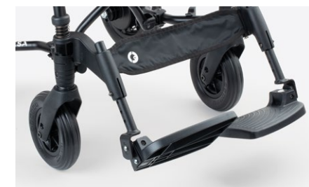
956 Footrests adjustable in tilt.