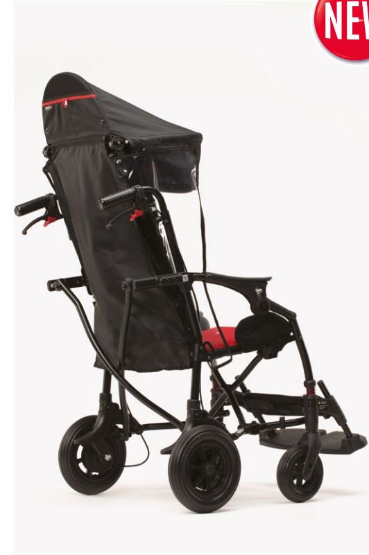
825B Back and lateral protection cloth it can be easily attached to the 819 canopy by means of zip and snap buttons, for greater protection from wind and rain.