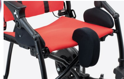
834N Padded abduction block removable. Available in two sizes.