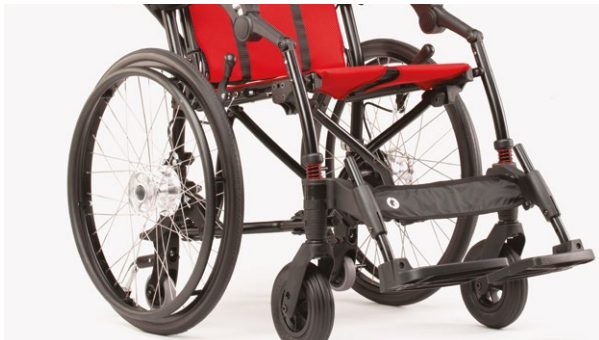
966 Kit self propelling wheels (22") with drum brake, anti-tip device and quick release. The additional component padded pelvic side support (958) can't be fixed.