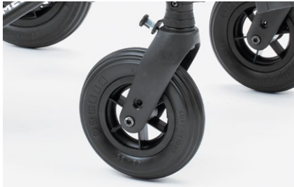
812 Front wheel directional locks.