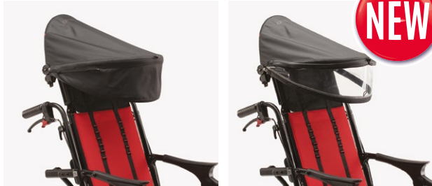
819 Elevating canopy foldable with the frame.