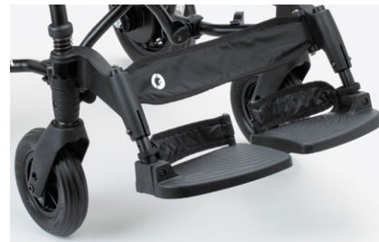
960 Heel rests.