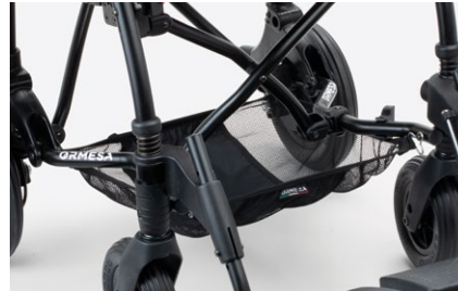
858 Shopping basket.