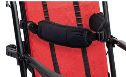
868 Wrappable and flexible trunk supports Multidjustable in height, width and inclination.