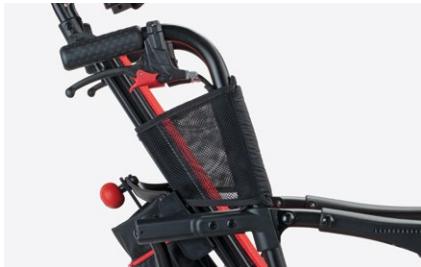
844 Padded side protection covers.