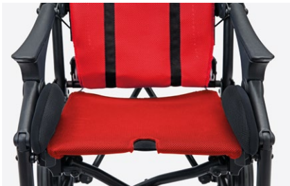
958 Padded pelvic side supports