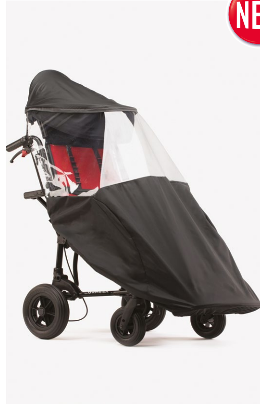
825 Rain cover to fix on the 819 canopy.