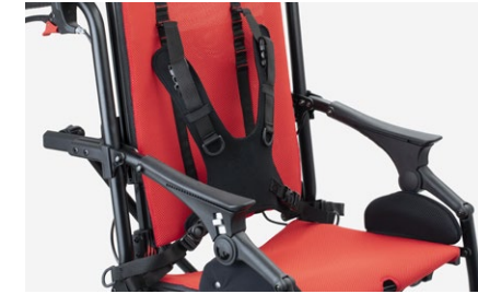
853 Vest harness