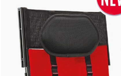
865 Padded headrest height adjustable. Only with backrest extension.