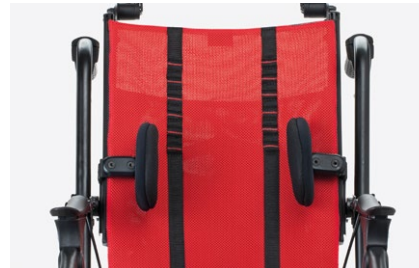
838 Trunk side supports adjustable in height, width and rotation. Available in two sizes.