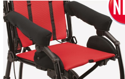
968 Padded covers for armrests. Easily removable and washing.