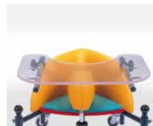
824 - transparent table

BIRILLO safeness is in compliance with the 93/42 European Directive :